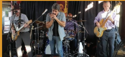
4:00 p.m. Awesome Blue