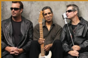
11:00 a.m. SmackDaddy Blues Band

Food available for purchase. Bring lawn chairs, blankets, and sunscreen. No alcohol! Canopies, umbrellas, and other portable shade equipment must be located in the canopy zone or be taken down once the festival begins.